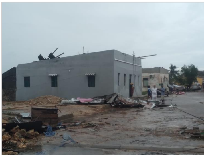
Damaged infrastructure in Ilha de Moçambique

With regards to infrastructure, so far 2,212 houses have been reportedly destroyed while 1,457 have been partially destroyed. The cyclone has damaged 47 classrooms in eight schools affecting the provision of education for 1,100 pupils. Eight health posts have also been affected by heavy rains and winds. Power outages and breakdown in communication have been reported as 37 energy stations have also been affected. The Mozambican state power company, Electricidade de Moçambique (EDM) said in a statement that 300,329 families in 20 districts of Nampula province are without electricity. Humanitarian partners report the loss of contact with Corane IDPs' site, where 5,934 people displaced by the crisis in Cabo Delgado are hosted.