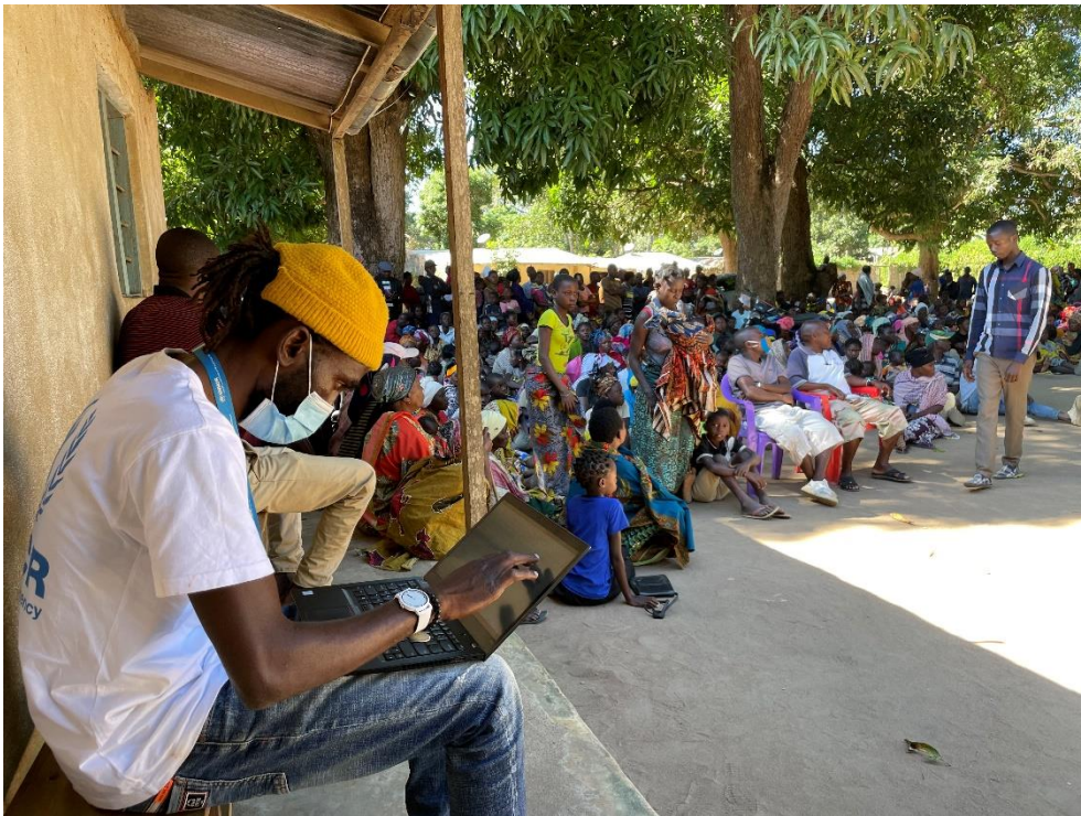
Verification of displaced families in Mueda, Cabo Delgado, for distribution of Core Relief Items

■ Planning distributions of Core Relief Items (CRIs) in Cabo Delgado and Nampula: From 21 to 28 May, UNHCR partook on an interagency mission to Mueda district, in Cabo Delgado, together with OCHA and IOM, to plan the distribution of CRIs in Mueda District. During the mission, the three agencies verified lists for CRIs distribution containing a total of 2,000 displaced families from different neighbourhoods in Mueda, Ngapa and Negomano. In Mueda, humanitarian organizations are planning to reach 10,000 people in need of assistance. UNHCR has been equally engaged in planning and preparing the upcoming CRI distribution in Corrane Nampula's IDP site, which will include tarpaulins, mats, blankets, mosquito nets, buckets, jerrycans, kitchen sets, and solar lamps. It is the first distribution in Corrane through direct implementation, targeting all 787 families (3,225 individuals living in this site).