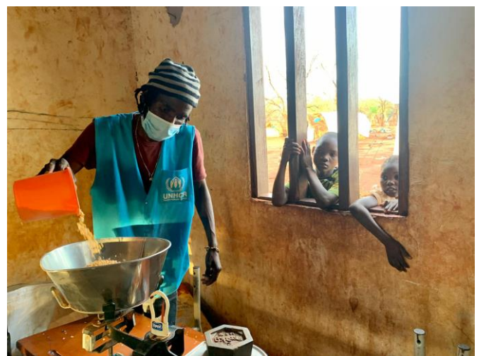
Distribution of food to IDPs in Negomano, Cabo Delgado, 170 kms away from the border with Tanzania