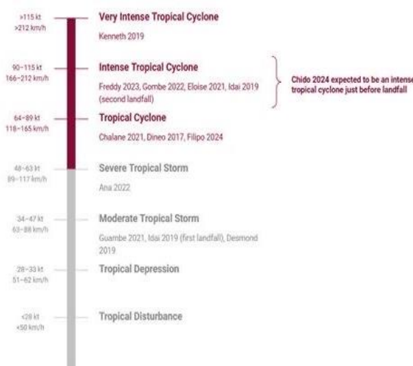
Figure 2: CHIDO compares to other cyclones.

The WFP-managed Disaster Analysis and Mapping (ADAM) system indicates that 1.7 million people are exposed to the Tropical Cyclone Chido, including a million people in Cabo Delgado who could be impacted by winds of more than 120 km/h.