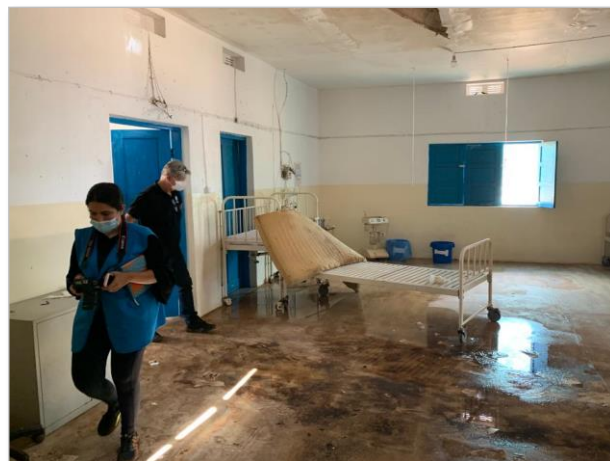
Figure 1: Damaged health facility in Corrane IDP site

Initial evaluation by the surge team deployed to Zambezia, indicate that some 50,000 people have been affected by Cyclone Gombe in the province. There are 16 transit centers operating in Zambezia hosting approx. 10,000 people and one resettlement neighbourhood hosting some 2,000 people. While Government authorities do not expect the figures of people affected to increase significantly once the assessments are completed, there is widespread concern that the number of houses destroyed could increase exponentially as homes are built with adobe which does not withstand the impact of heavy rains. Local authorities indicated that most of the damage in the province was caused by Storm Ana which affected infrastructure while Cyclone Gombe's impact is restricted to excess water from the ten days of consecutive rains and flooding in low lying areas.