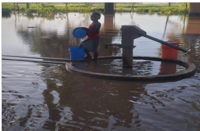
Figure 2: flooded community in Maganja da Costa

the local health facility, which had recently been refurbished by UNHCR, the roof had been blown away by Gombe and equipment had been damaged, and a makeshift tent is now being used as a delivery room. The team also went to Namialo distribution centre, where INGD and UNHCR are collaborating on a joint distribution with beneficiaries receiving shelter kits (plastic sheets, blankets, and sleeping mats) as well as pre-cooked food rations. The team observed that the distribution was well coordinated ensuring that communities got a complete package enabling them to rebuild/return to their homes.